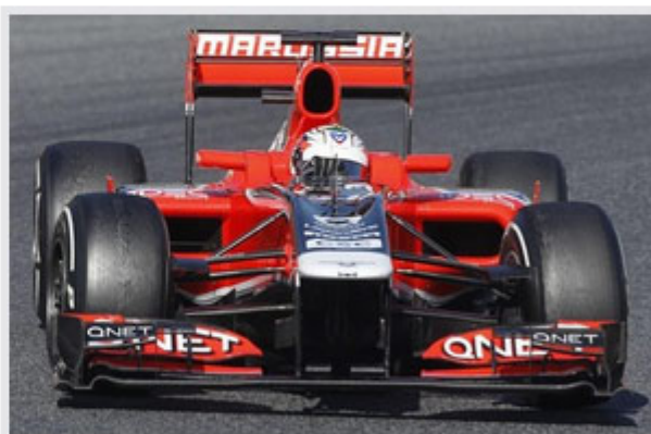
► Marussia tiene un nuevo patrocinador

Los coches de Marussia que serán pilotados por Timo Glock y Charles Pic, esperan 'brillar' en la parrilla y tener una imagen "inmaculada" en cada gran premio.