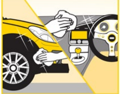
Use a Microfibre Cloth to remove any excess.